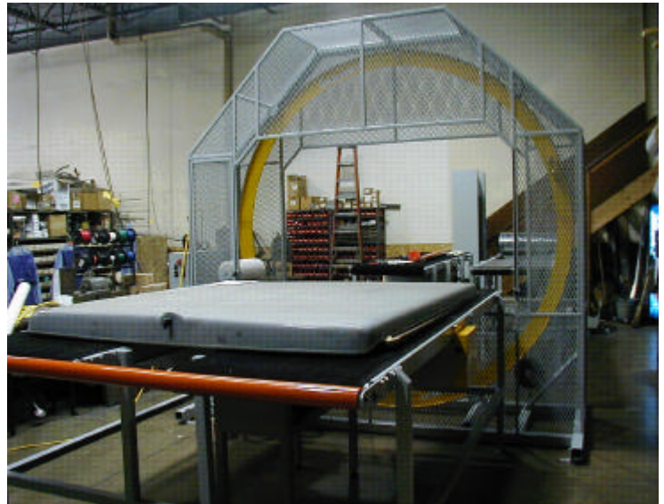
SHOWN WITH OPTIONAL POWERED BELT CONVEYORS

DESCRIPTION: A horizontal winder to wrap products with a maximum width of 91" and a minimum of 36" in length. Foot or selector switch operated variable speed wrapping ring with a 10-12" Kalamazoo variable tension film delivery and manual adjustable product hold downs.