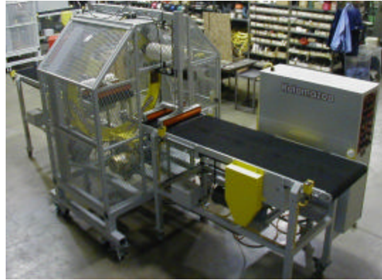
Shown with optional conveyors and casters.

820FA-12 Fully-Automatic Horizontal Winder Stretch Wrap Systems with 12" Variable Tension Film Delivery and Optional Conveyors.